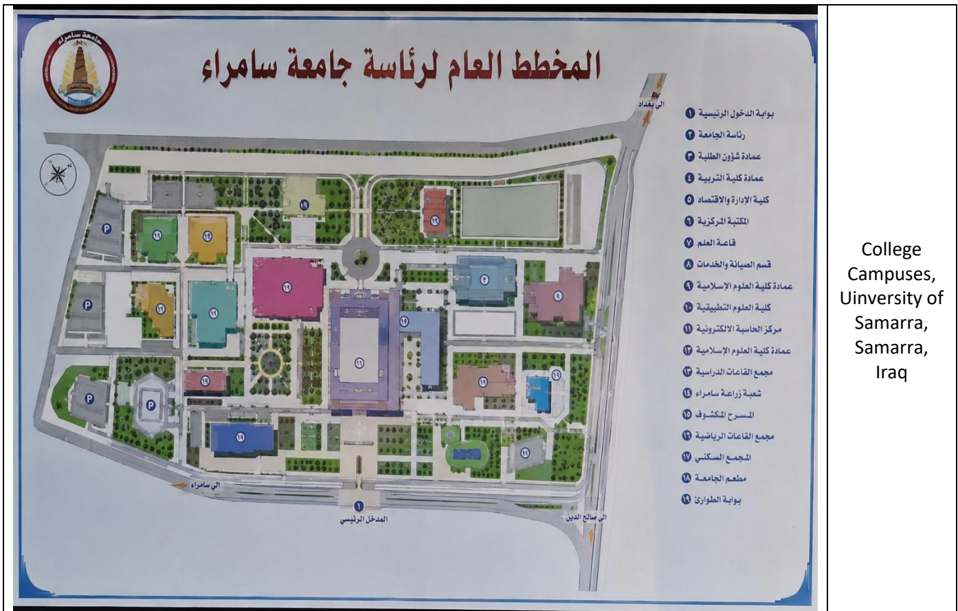
College Campuses, University of Samarra, Samarra, Iraq